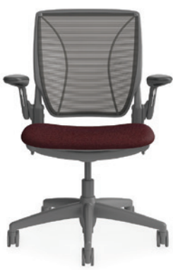
World LM Meeting