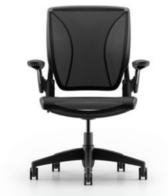
World LM Task