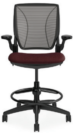
World LM Stool