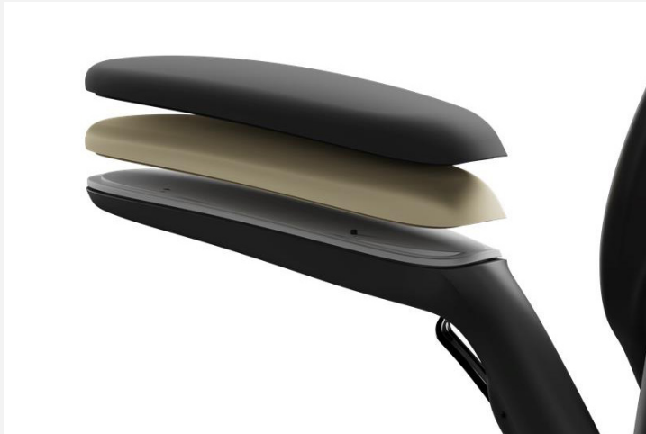
Duron arm pads

Warranty World LM comes with a 12-year warranty for components and parts and a five-year warranty for fabric and cushions.